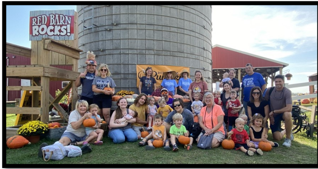
ECFE at the Red Barn Learning Farm