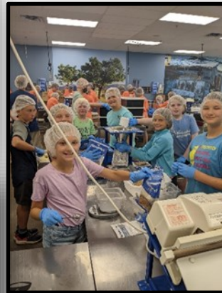
Kids in the Community