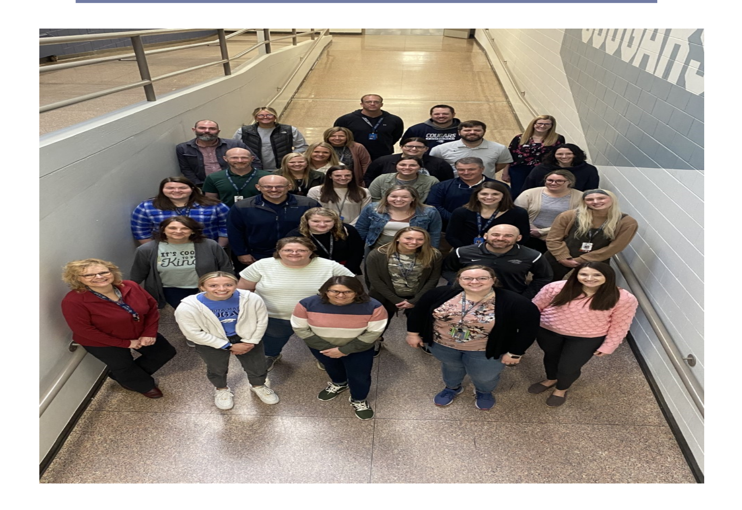
3-6 Elementary Teachers. Teacher appreciation week was celebrated May 8-12.