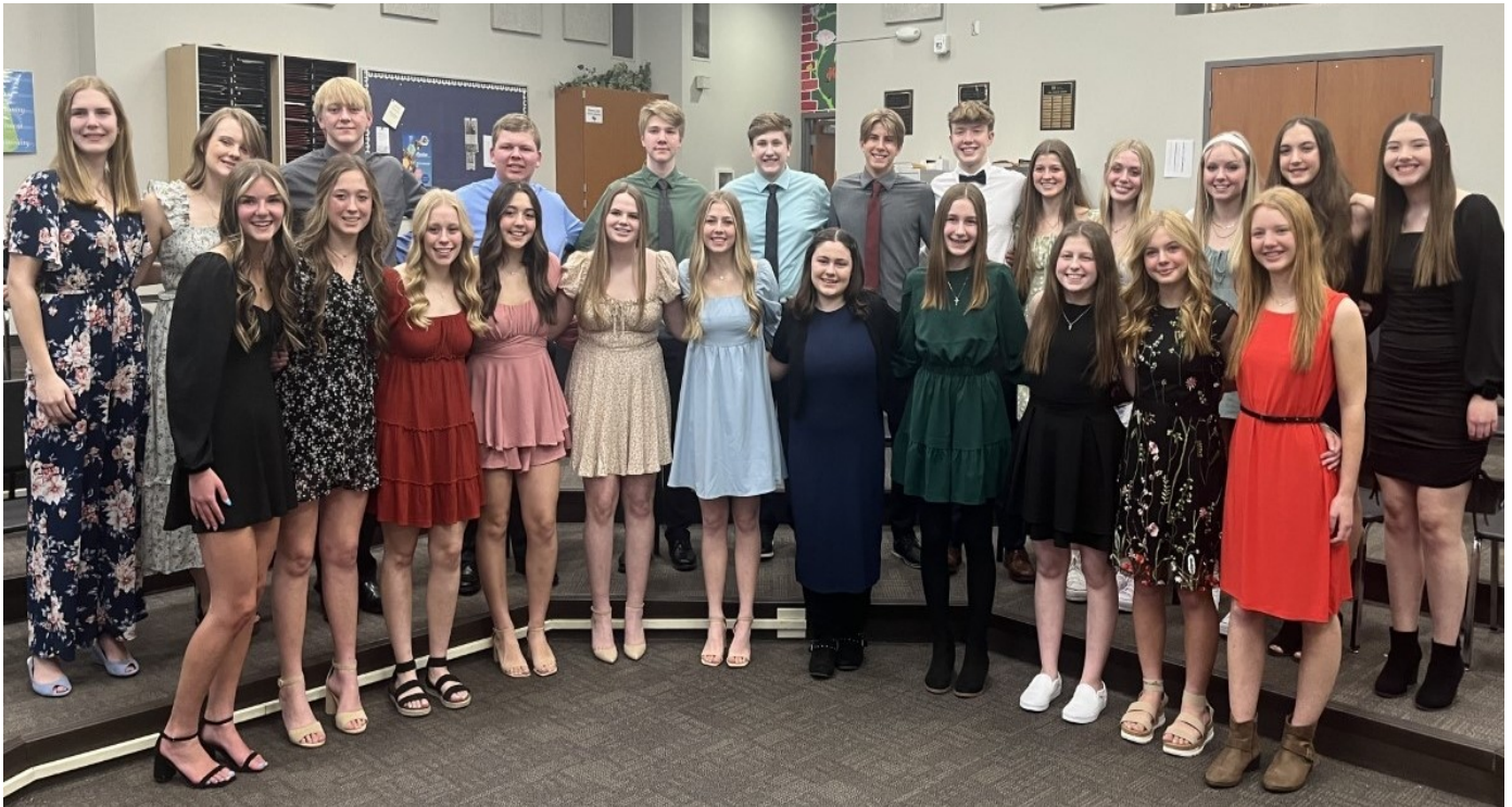
2023 National Honor Society 24 New members were inducted into the National Honor Society on Marcy 14th. Congratulations Students!