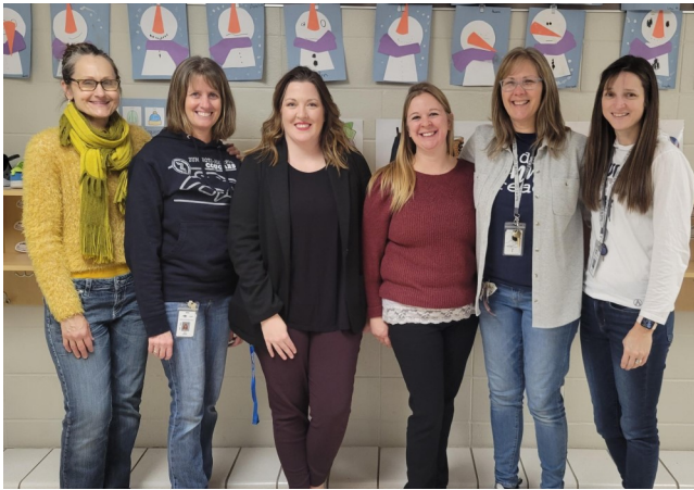
Early Childhood Para's