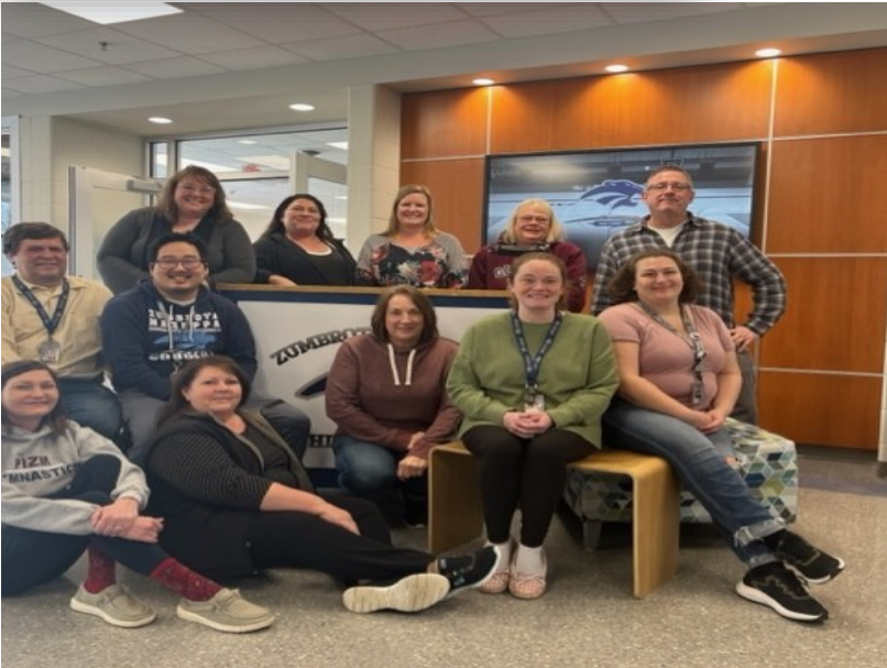
Middle/High School Para's

A multi-tasking educational rockstar who lives to inspire and loves to encourage.