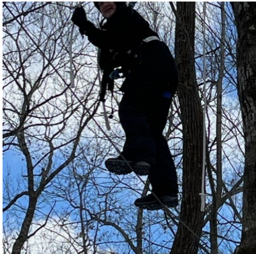
5th Graders at Eagle Bluff