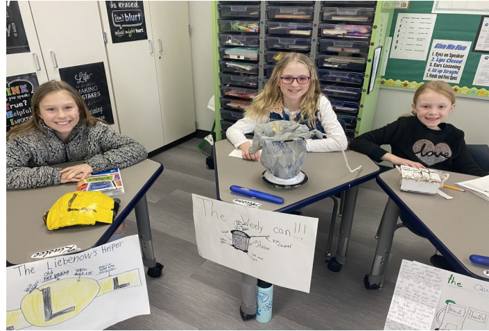
4th Grade Inventions!

BinaxNOW OTC Available - The school has a large quantity of BinaxNow OTC test kits that the State of MN sent us for free. We would like to send test kits home with students so that families have a kit at home if needed. Be aware that the expiration date on these kits say they expire this month, however we were told by the manufacturer that the expiration date has been extended. They have a 15-month shelf life and will still be accurate and can continue to be used.