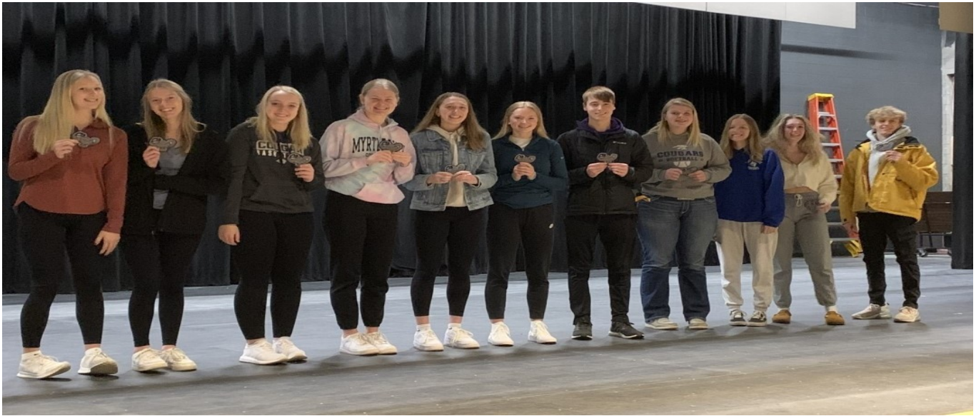
12 Grade Academic Letter Winners