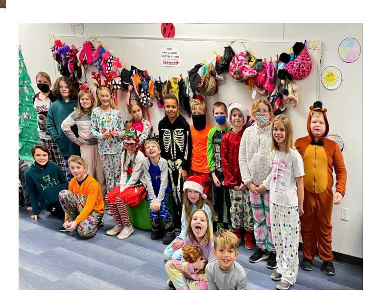
4th Grade Mitten Tree