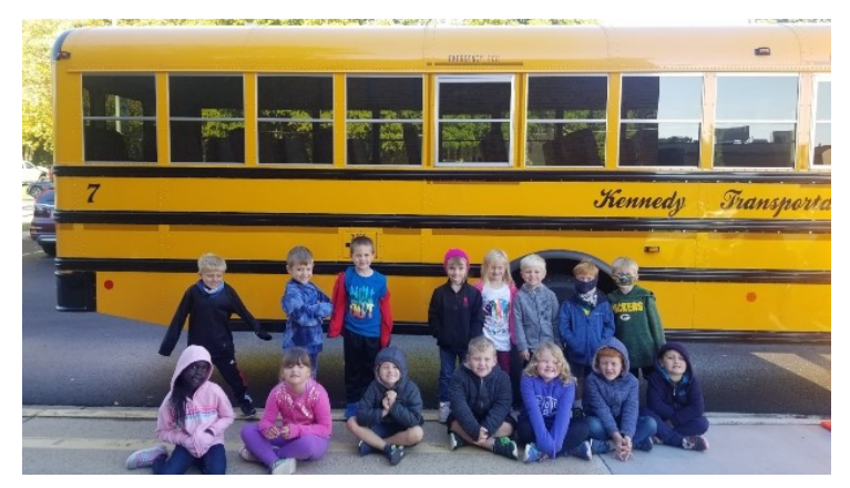
Primary School Bus Safety