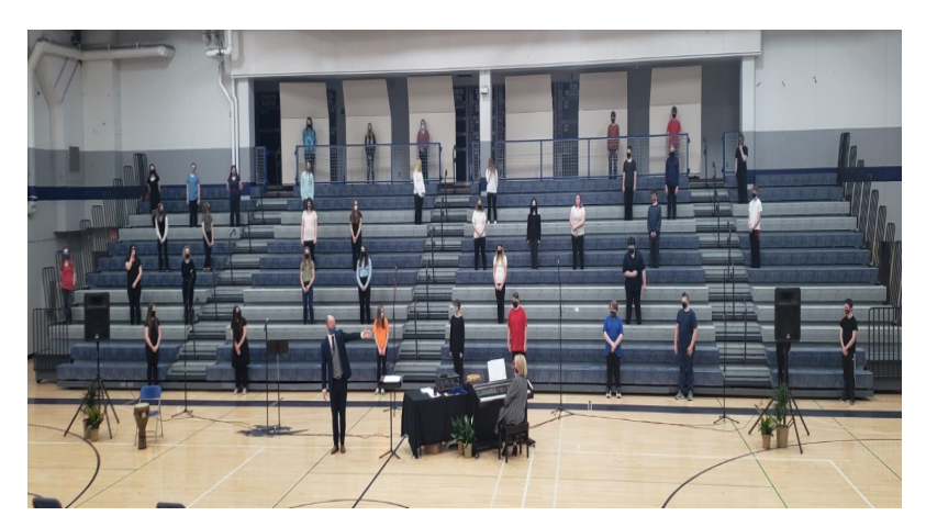
The ZM Middle School Choir made up of 7th and 8th grade singers.

If you would like to view the concerts, they are posted on the Zumbrota-Mazeppa Choirs Facebook page.