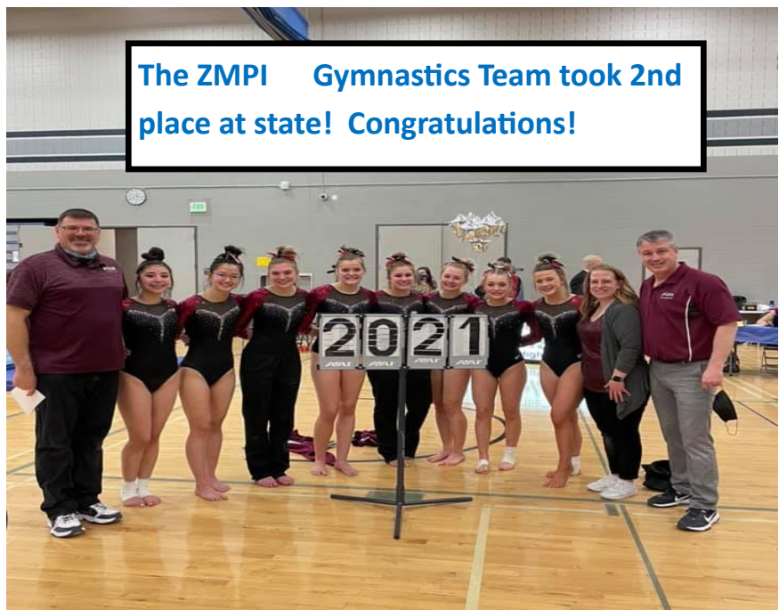
The ZMPI Gymnastics Team took 2nd place at state! Congratulations!