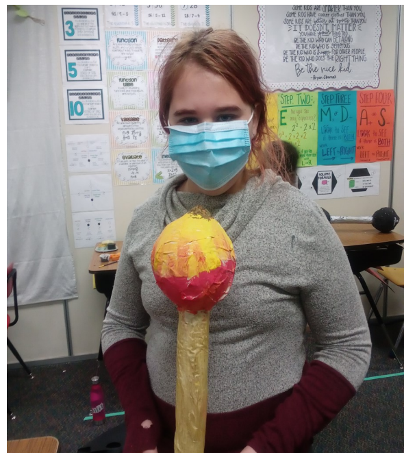
ZM Elementary Art Class

If you choose to file exemptions for any immunizations, forms are available on ZM school website under Parents/Health services/Immunizations, or you can contact the school nurse at 507-732-7848. Students will not be eligible to attend the first day of school in 2019 until we have up to date immunizations on file.