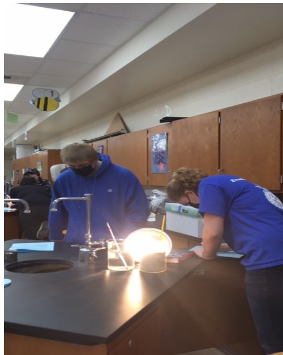
Students learning about the uneven heating of the Earth in science lab.

Inspire Science sparks students' curiosity through fascinating real-world phenomena. Students investigate, problem-solve, argue, and discuss scientific phenomena to make sense of the world from their perspective. We've already been hearing positive feedback from teachers regarding the depth of learning, critical thinking and problem solving skills that our students are enhancing both because of the new standards and new curriculum.