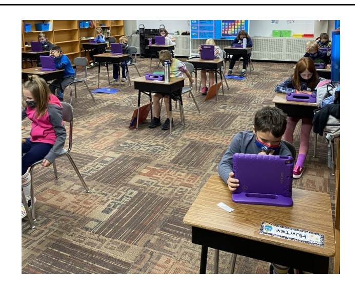
iPads arrived for third graders!!