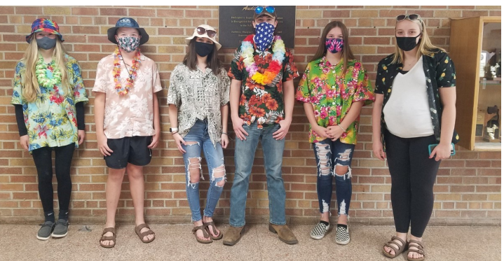
Homecoming week provided some crazy costumes during dress-up days.