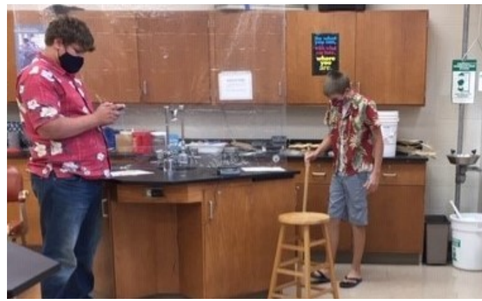
Studying speed in 9th grade science class