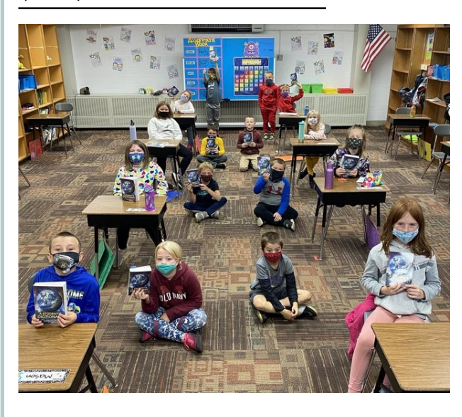
Thank you Lions for the third graders' dictionaries