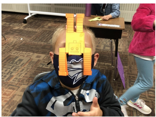
Third grade made "balancing robots" in science

National Honor Society held its long-awaited induction ceremony recently after Covid 19 postponed the spring service. NHS students are chosen for their qualities of leadership, scholarship, service, and character. Congratulations to these outstanding students!