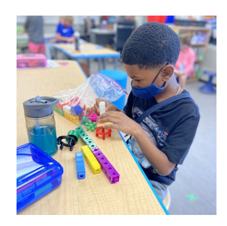
LEGO Learning in the Primary