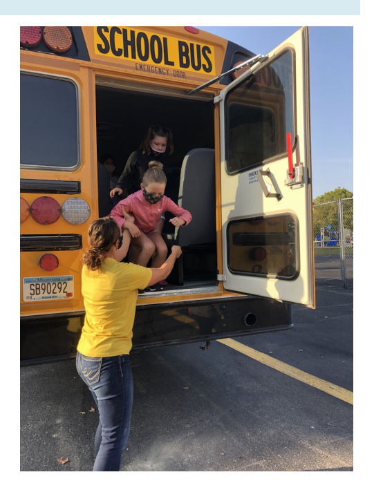
Bus evacuation and training at all three sites keeping our students safe