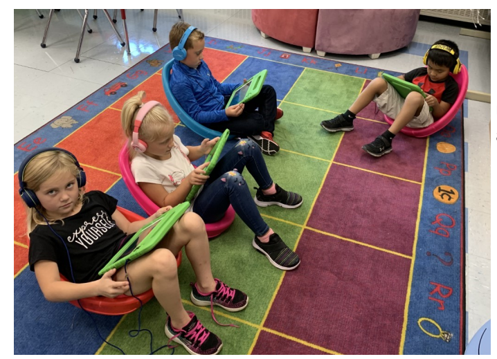
Doing monkey math with an iPad app