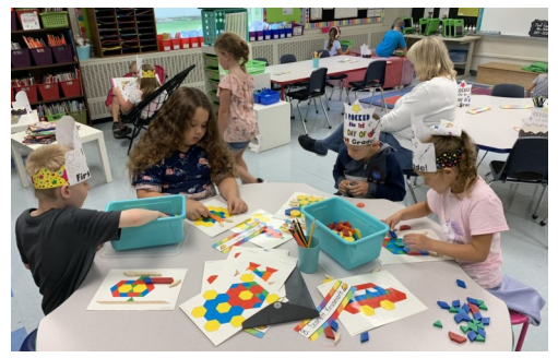
Grade 1 practicing with math blocks