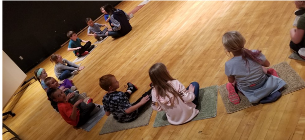
A <u>HUGE</u> thank you to Prigge's Flooring for donating many carpet squares to the primary music classes—makes sitting on the floor so much more comfortable!