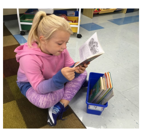
What is better than a good book?