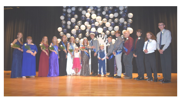
Homecoming Royalty Court