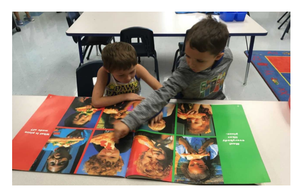
First graders read a "big" book!