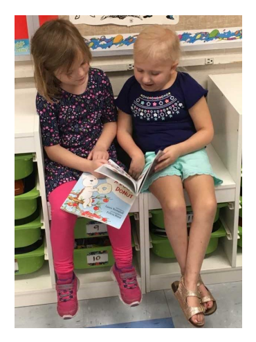
Life is always better with a friend!!