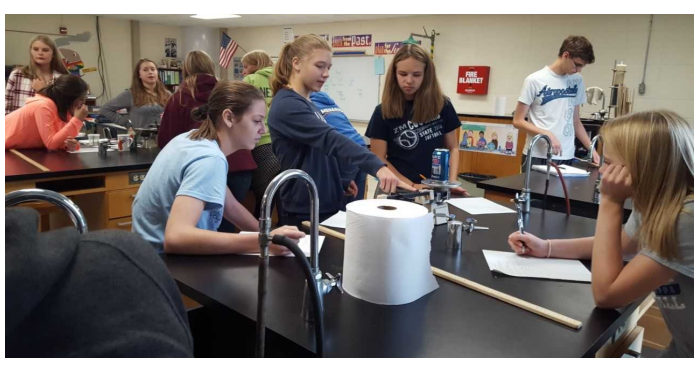
9<sup>th</sup> grade physical science students measuring mass, length, and volume of a variety of objects.