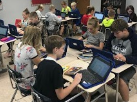
Elementary students working together in their social skills class while primary students use their iPads