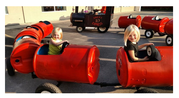
Early Childhood hosted a transportation night