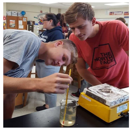
Chemistry students run experiments on a phase diagram for water