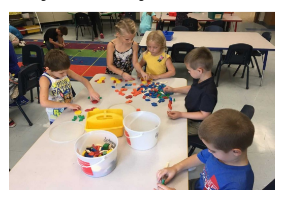
Math is such fun with manipulatives.