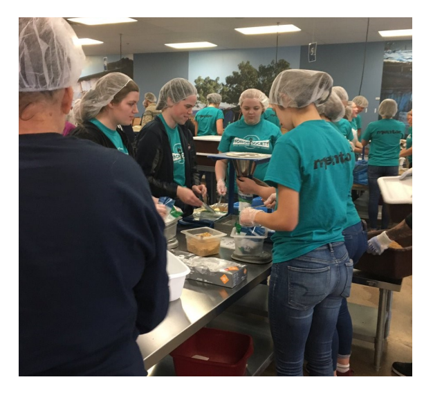
NHS students also made meals at Feed My Starving Children