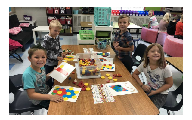
Grade 2 math