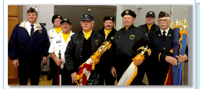
Thanks to the veterans who gave of their time for our students

ZM is always proud to have members of the Zumbrota VFW and American Legion and the Mazeppa American Legion and Auxiliary, as well as the Mazeppa Honor Guard as guests of honor. We are honored to salute you on this important day and every day!