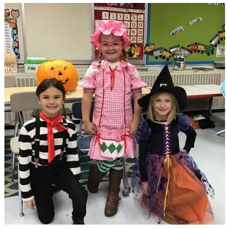
Halloween fun in the Primary