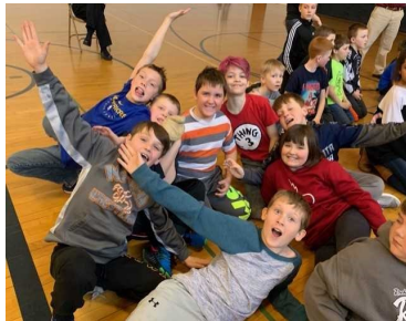
Grade 4 is having fun!