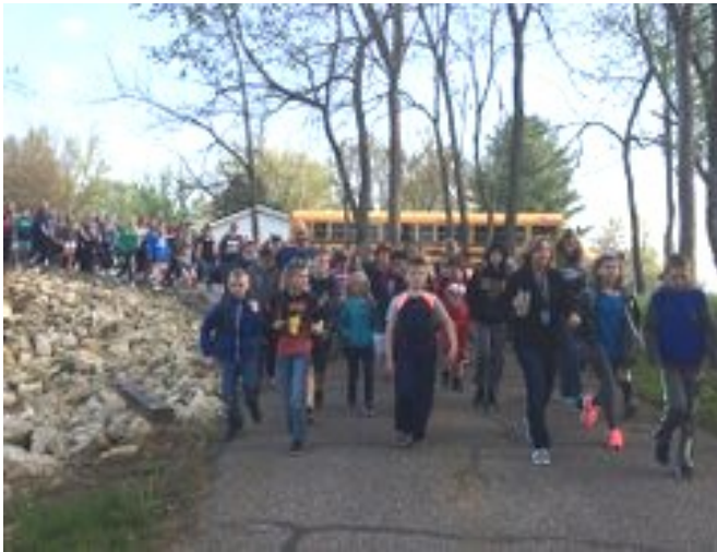
Elementary students enjoyed a beautiful morning on their last Walk to School Day