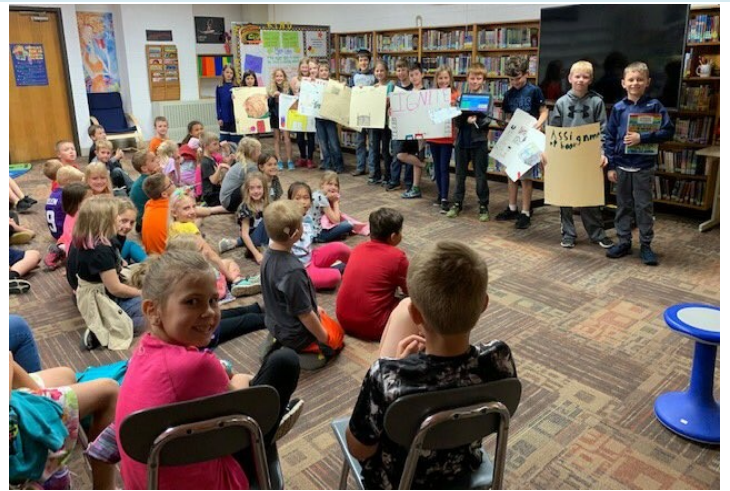
Third graders shared highlights of their year during second grade orientation