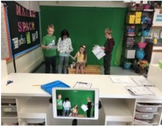
Second graders write/perform their plays