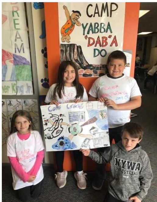
4 th graders celebrated camp week with many fun activities.

Graduation has been moved to Fri, May 31 beginning at 7 pm in the ZMMS/HS Gym.