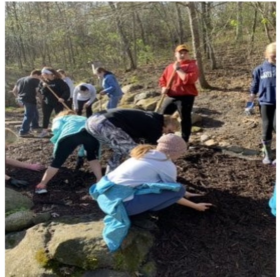
Great workers for Community Service Day