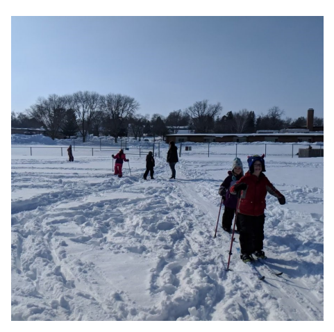
Gr 2 practices cross country skiing in Phy Ed