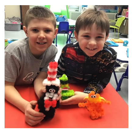
Using bunchem's to make Seuss characters.