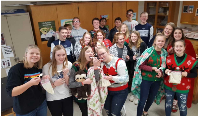
Making ice cream in physical science—YUM!