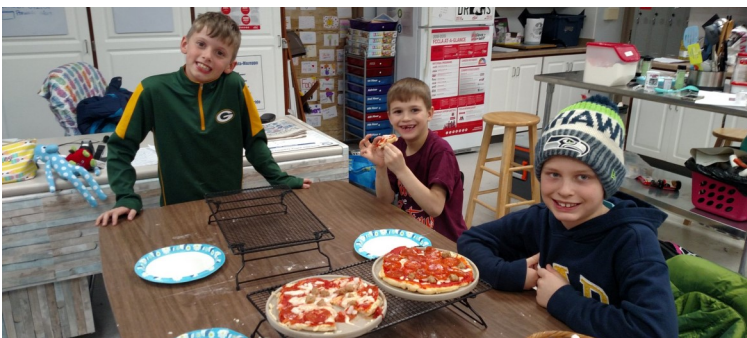
Making fajitas in Community Ed Cooking Class