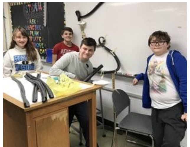
Gr 6 students built roller coasters in STEAM to study motion & energy.