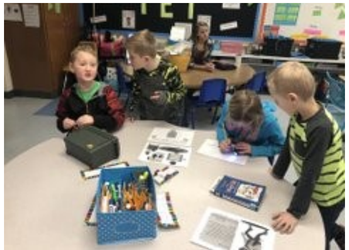
Grade 2 used the 2-D Shapes Breakout Box to learn about communication, critical thinking, collaboration, creativity and perseverance.