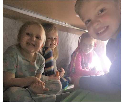
PBIS Reward Day—Camping! Bring your flashlight, book, blanket, and read!!