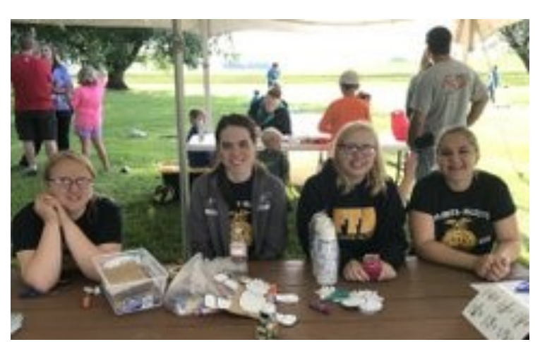
FFA members are helping at Goodhue County Breakfast on the Farm- making cow puppets and planting seeds with kids!