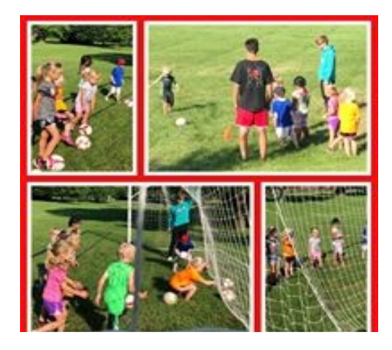
Soccer and more soccer