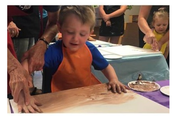
Painting like Picasso