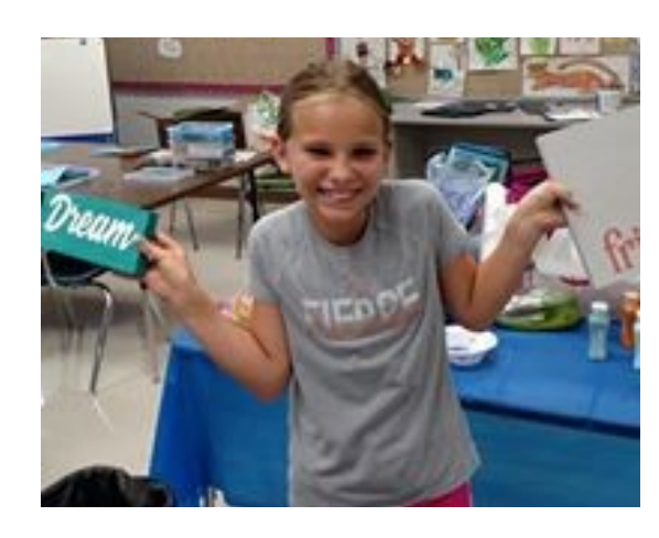
Great Community Ed classes!!