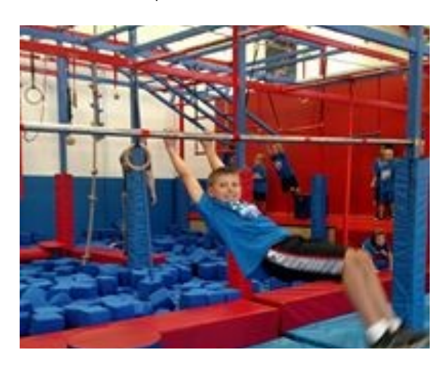
Exciting field trips in Community Ed