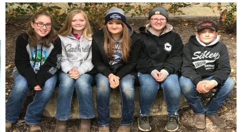
Dairy Judging Team