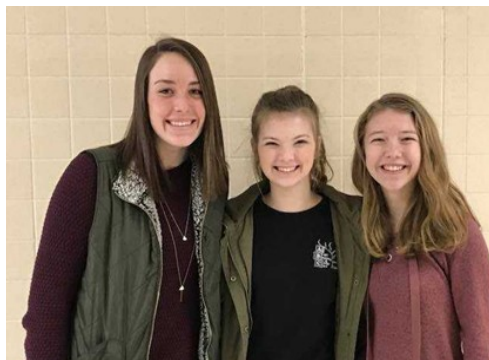
Farm Business Management Team