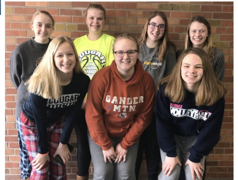
Best Informed Greenhand Team