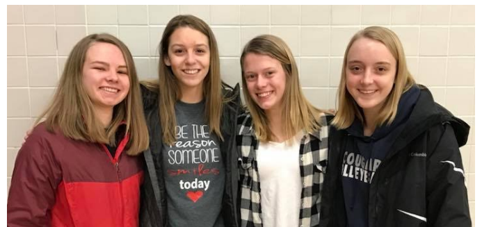
Small Animal Team