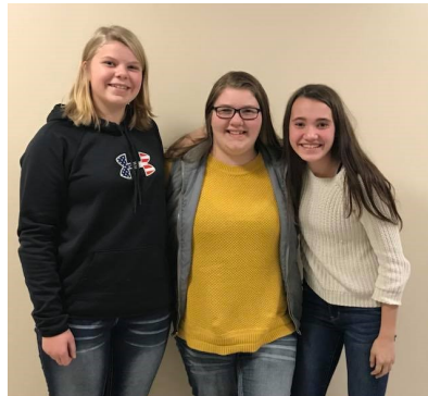
Milk Quality Team