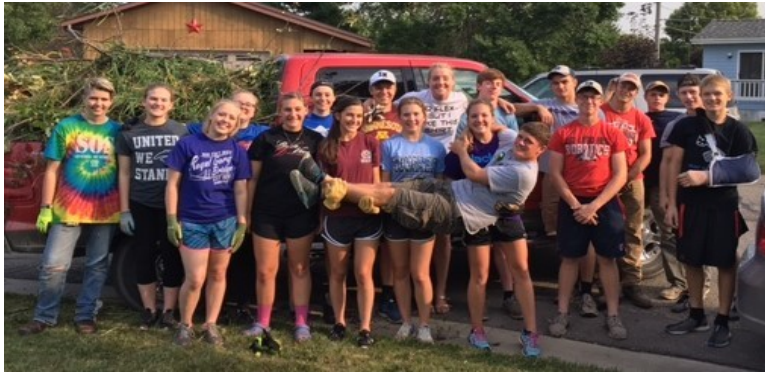
National Honor Society students clean up around town