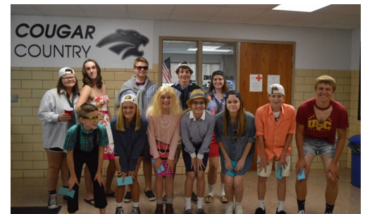
Dress up day as frat boys/sorority girls