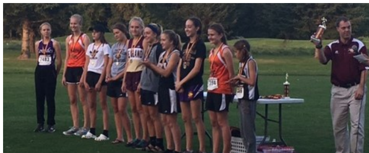
Girls Cross Country Takes 1 st Place!!