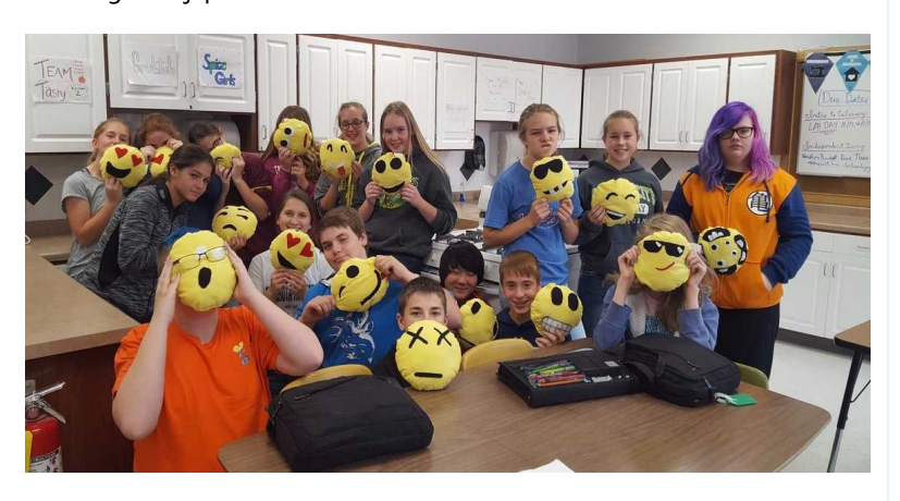
Making Emoji pillows in FCS class

Chemistry students celebrated "Mole Day" on Oct. 23 The mole is a unit of measurement used to convert between representative particles, mass, and volume. 1 mole = 6.02 x 10^23 particles. Thus, from 6:02am-6:02pm on 10-23 chemists around the world celebrate Avagadro's famous unit of the mole. The theme for Mole Day 2017 was the Molevengers!