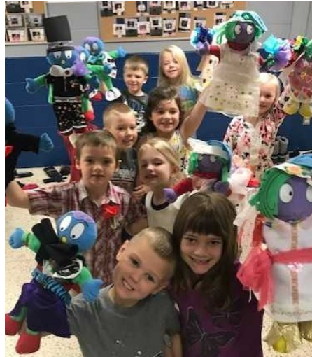
Q weds O in Kindergarten