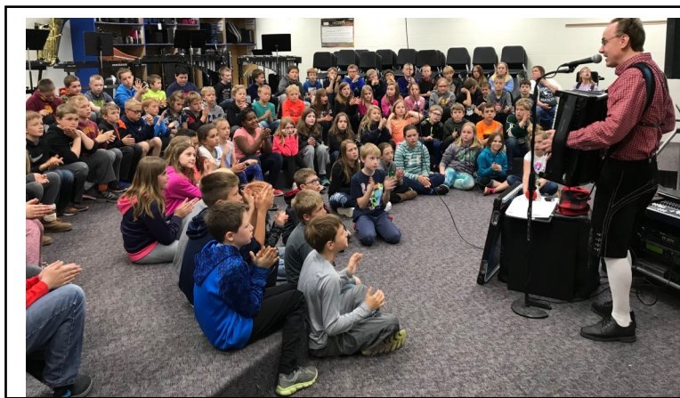
Grade 4 learned about the history of polka music and its connection to the Midwest today.