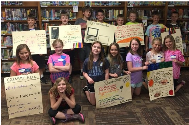
Grade 3 welcomes the incoming second graders