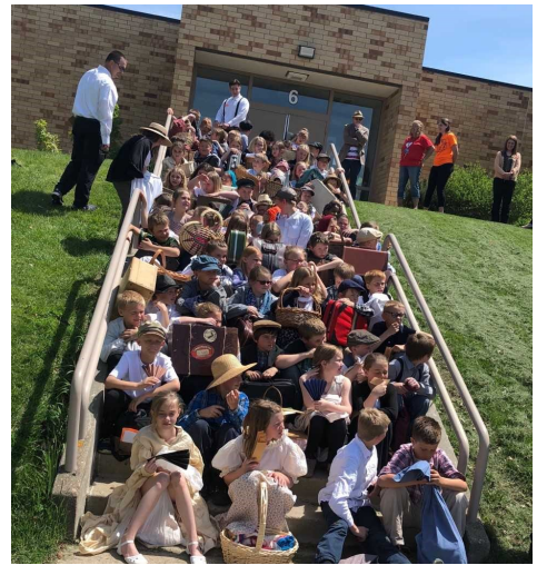
Grade 4 does an Ellis Island simulation- here they are waiting to enter the US