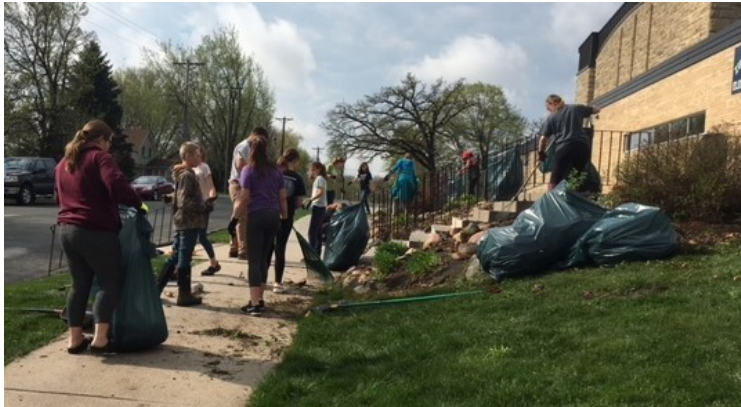
Community clean up day was May 9. Two students traveled to Florida for Habitat for Humanity as part of the SEA program.