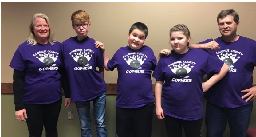
Congrats to Goodhue County Gophers Bowling Team! All 4 qualified and participated at the Adaptive Bowling State Tournament!!

BYE FOR NOW AND SEE YOU LATER HAVE AN AMAZING SUMMER!