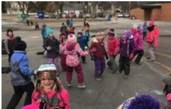
Recess "talent" show with singing and dancing!