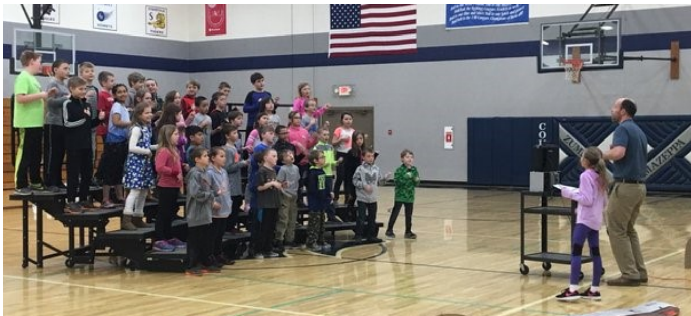
Third Graders performed “Wing It” for their spring concert—they did great and “flew through” the performance!!