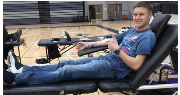
National Honor Society Blood Drive a success!