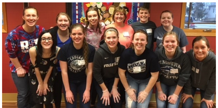
NHS serves a meal at the Ronald McDonald House in Rochester