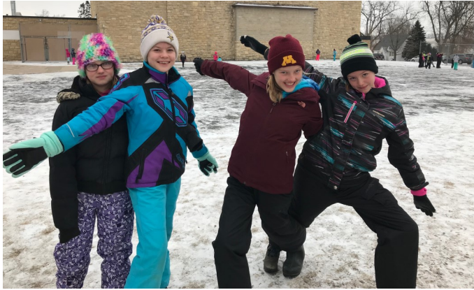
“Snow” much fun in the elementary!