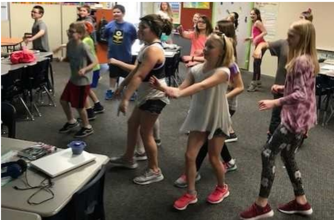
Beach day fun in the primary—doin’ the Limbo!!