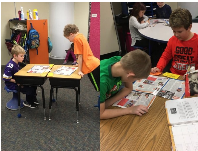
Celebrating Dr. Martin Luther King Day and our teachers have a work day.