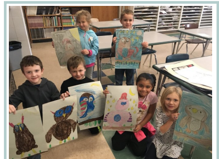
Gr 1 artists design owls in Art Class while elementary students learn about Dr. Martin Luther King on his commemoration day.