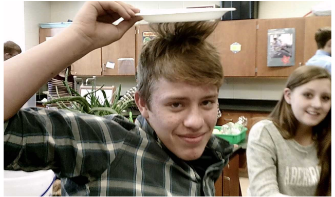
Learning about electricity in 7th grade science and ZUMBA exercise in grade 4