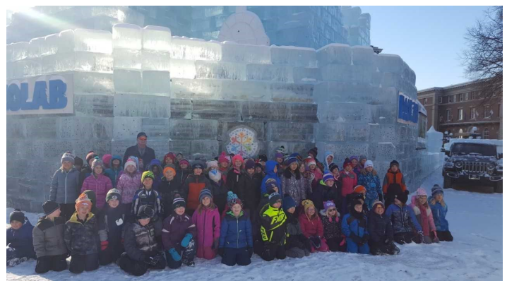
Grade 2 visited the Ordway and Rice Park's Ice Castle!