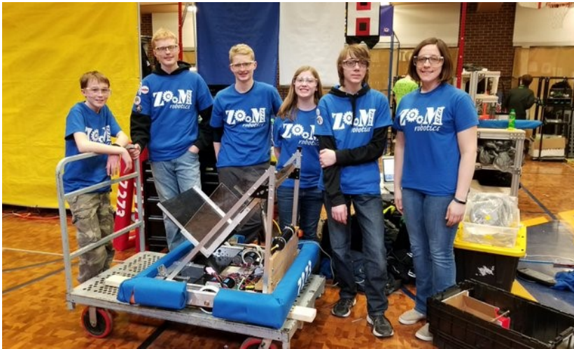
The Robotics team completed their robotics building and will compete