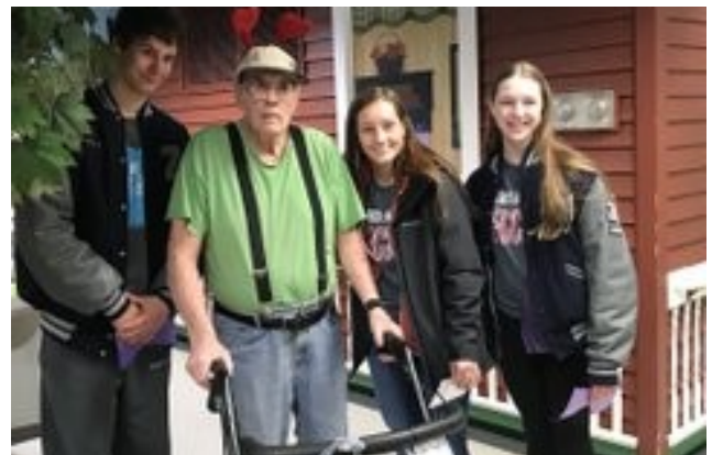
FCCLA visits nursing home to deliver Valentines