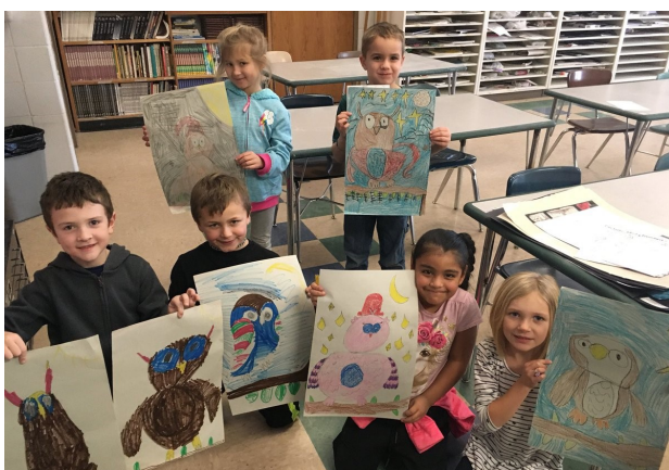
Grade 1 designs owl pictures