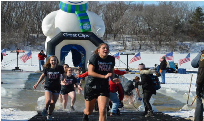
Plunging for Special Olympics and raising $2400