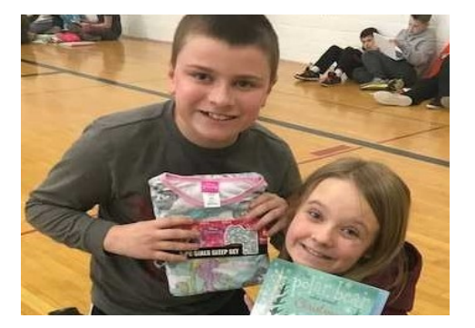
Gr 5 donated pjs and books for those less fortunate