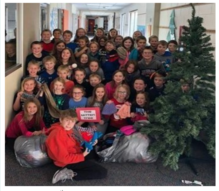
Students in the 4<sup>th</sup> grade collected and bought hats, mittens and scarves for the mitten tree. Donations were shared with the food shelves in both communities.