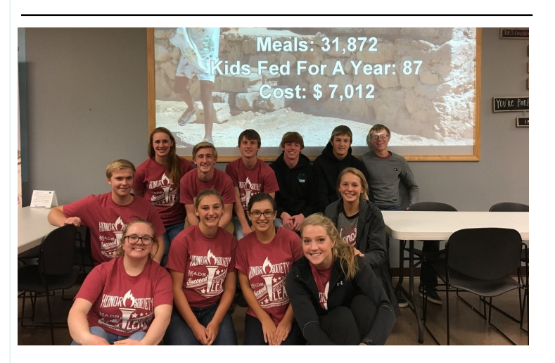
ZM's Chapter of the NHS donates to Feed My Starving Children