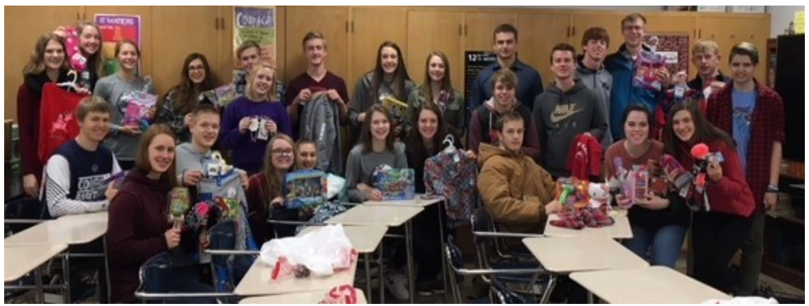
In the spirit of Christmas, National Honor Society members donated to the Salvation Army and Ronald McDonald House and cookie supplies to the area food shelves.