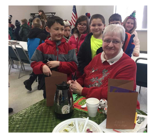
Gr 3 sharing with Mazeppa Senior Citizens