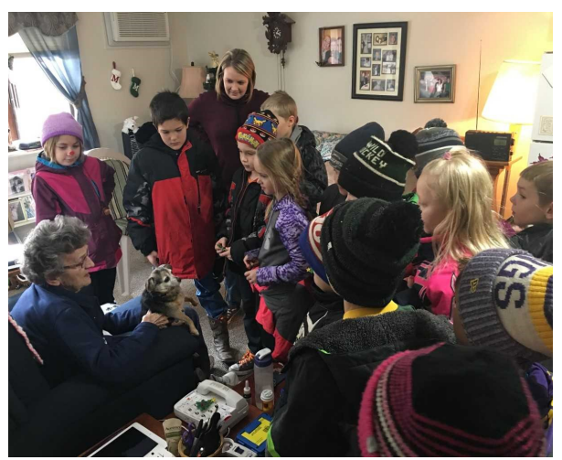
Gr 2 visits Zumbrota Health Services