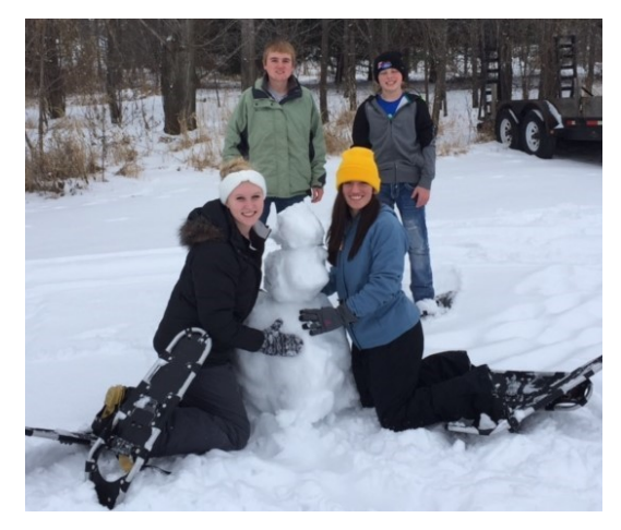
Ninth grade phy ed students enjoyed the snow and the activities it brings-from snowshoeing to building a snowman!!

ped up in the winter? Don't let ep you indoors—embrace this