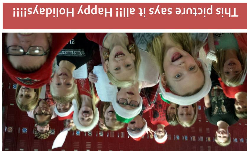
This picture says it all!!! Happy Holidays!!!!

Notice of Non-Discrimination: Zumbrota-Mazeppa ISD 2805 does not discriminate on the basis of race, color, national origin, sex, disability, or age in its programs and activities. The following person has been designated to handle inquiries regarding the non-discrimination policies: Superintendent Gary Anger, 343 Third Ave NE, Mazeppa, MN 55956. Telephone: 507-732-1400.