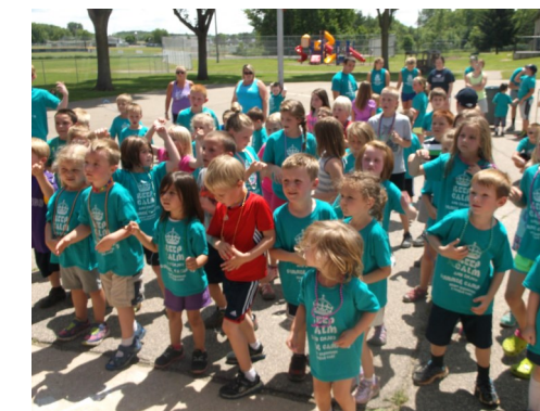
Cougar Care kids were entertained all summer with many fieldtrips and events. It was a great summer!!