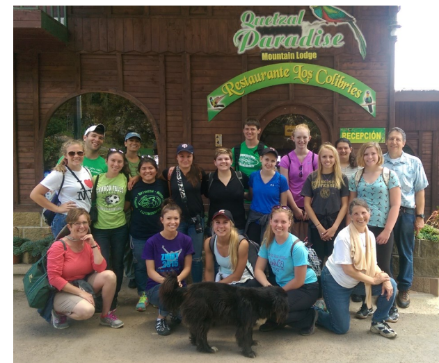
Four ZM Spanish students and teacher, along with area schools, traveled to Costa Rica in June.

It was a busy, entertaining summer for ZM's students—from traveling to Costa Rica to dancing in the park!