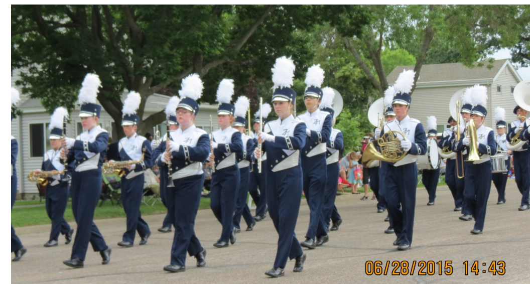
The ZM Marching Band performed in numerous area parades this summer, making our school proud!