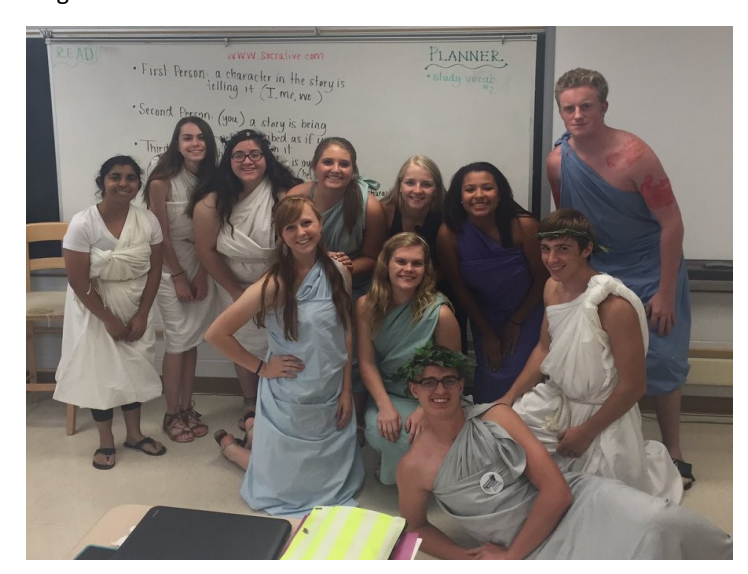
Senior toga day and class poster painting