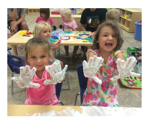
ECFE classes have begun