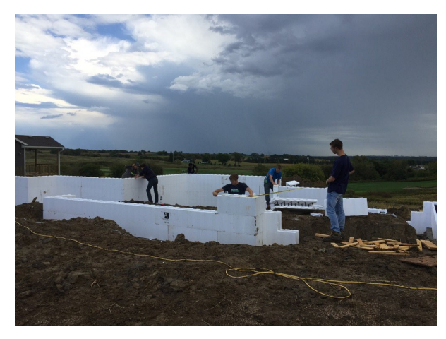
Vocational construction house work has begun