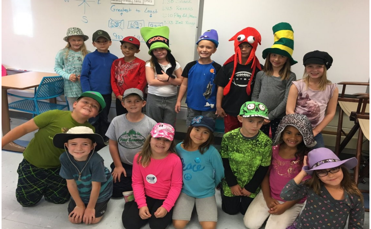
and crazy sock day in the primary!!