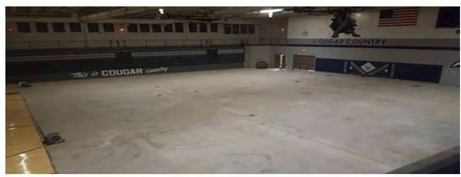
After a flood on the high school gym floor, work has begun on the replacement