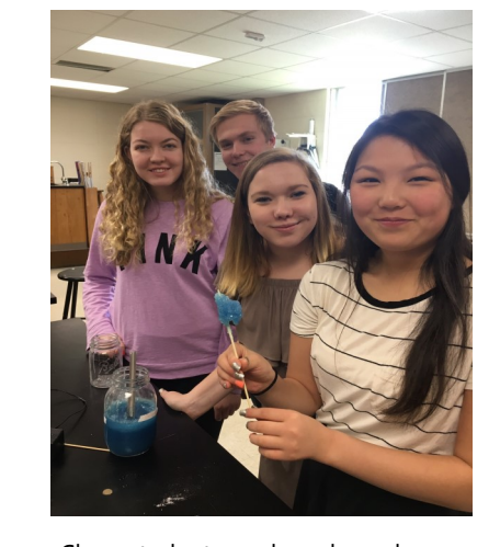
Chem students made rock candy with their supersaturated solution