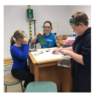
Gr 6 students used the STEAM room to research electronic devices and their ecological impact on the environment.