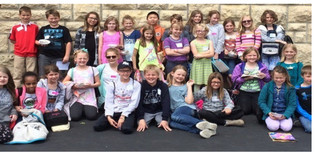
Young Artists/Young Writers Conference