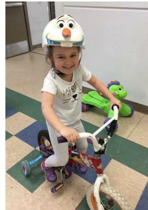
ECFE Indy 500 fun