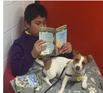
Izzy, the Reading Dog, enjoys a story