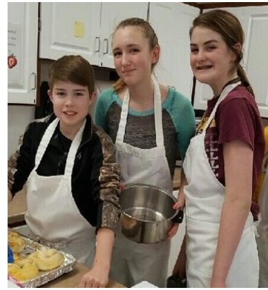
Middle School students made pretzels in FCS classes