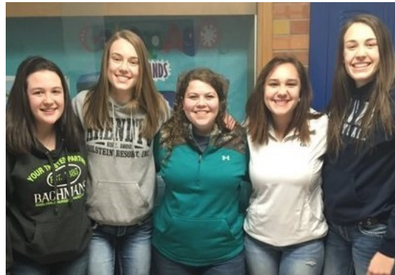
FFA members attend H2O Conference