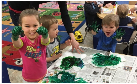
"Messy" fun in Early Childhood classes