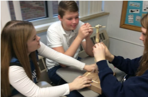
6, 7, 8 graders built earthquake-proof cell towers with the help of IBM engineers