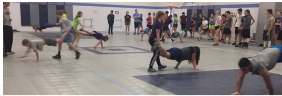
Getting in shape for track