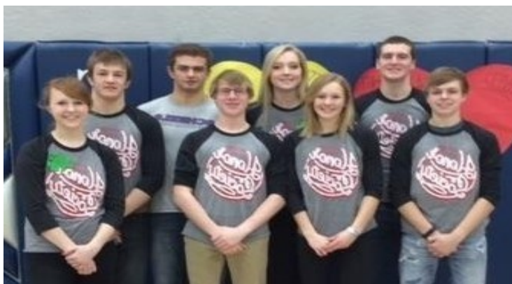
NHS Blood Drive was a great success-70 units collected!!