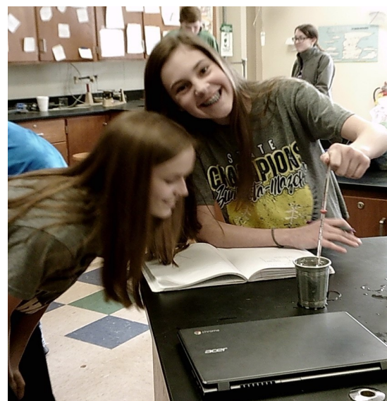
MS science students learned how to find the dew point—helpful info for our MN summers.