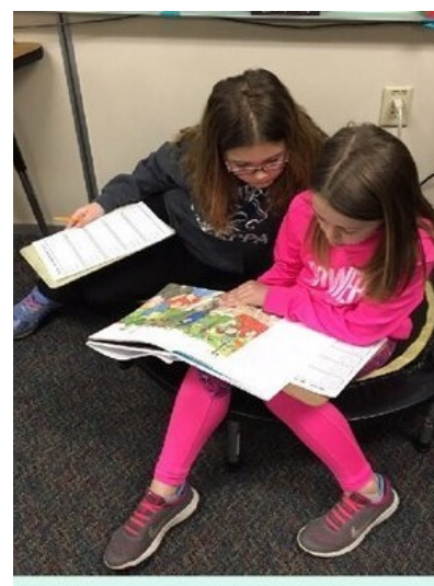
3 rd graders peruse many picture books to determine the theme.