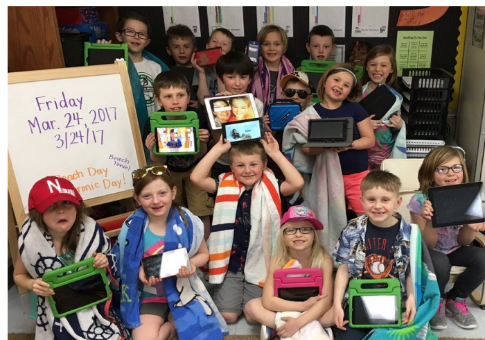
First graders met their reading goal in April!!