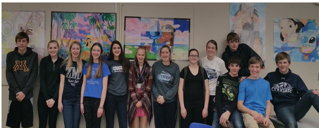
High School art students show off their scaled art posters—pretty impressive!