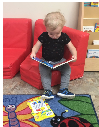
ECFE "See What I Can Do" fun