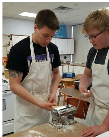
Advanced culinary students made pasta from scratch—no boxes here!