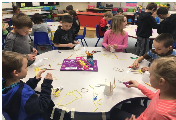
1 st grade students developed a dinosaur launcher—the dinosaur flew 22 feet!! Good engineering skills!